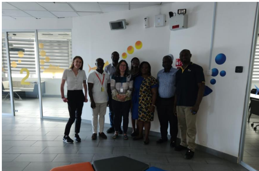
Figure 2: Ghana Fisheries Commission meeting attendees