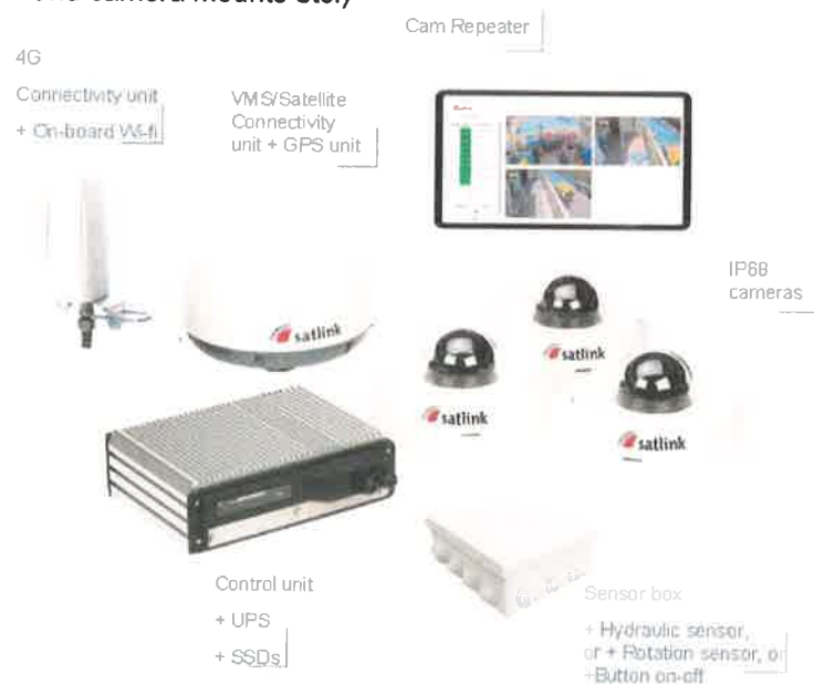
Figure 4 - Standard SeaTube configuration 2