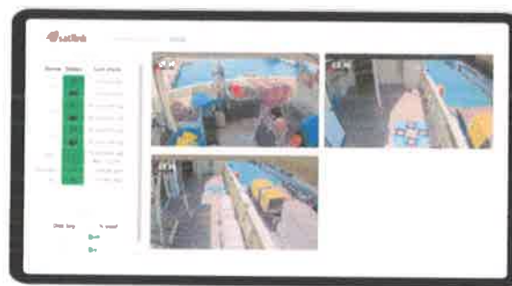
Figure 2 - On-board Cam repeater

The information being recorded can always be checked on-board by the vessel operator thanks to the Cam repeater unit. A tablet or laptop connected to the Control unit that shows the information coming from the cameras and the system's health status.