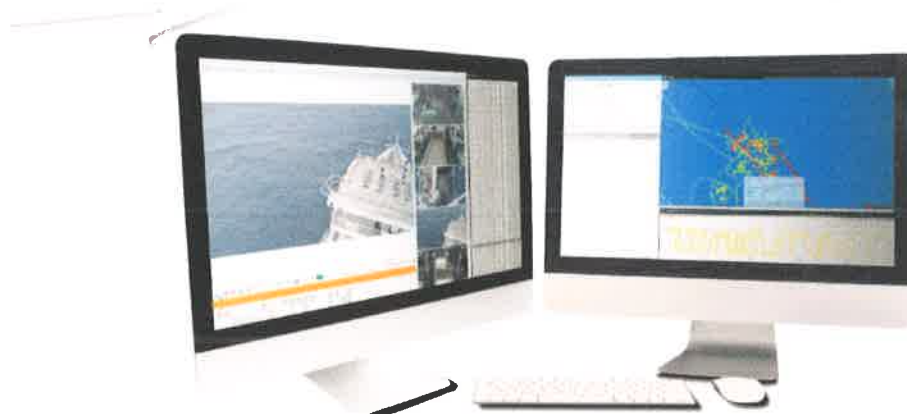
Figure 3 - Satlink View Manager review software

The SVM annotation profile is customizable for each fishery. The annotation profile consists of a set of templates which include fishing and non-fishing events that the analyst would use to annotate what they see in the recording (i.e., "fishing start", "fishing end", "catch", "bycatch" or "pollution").