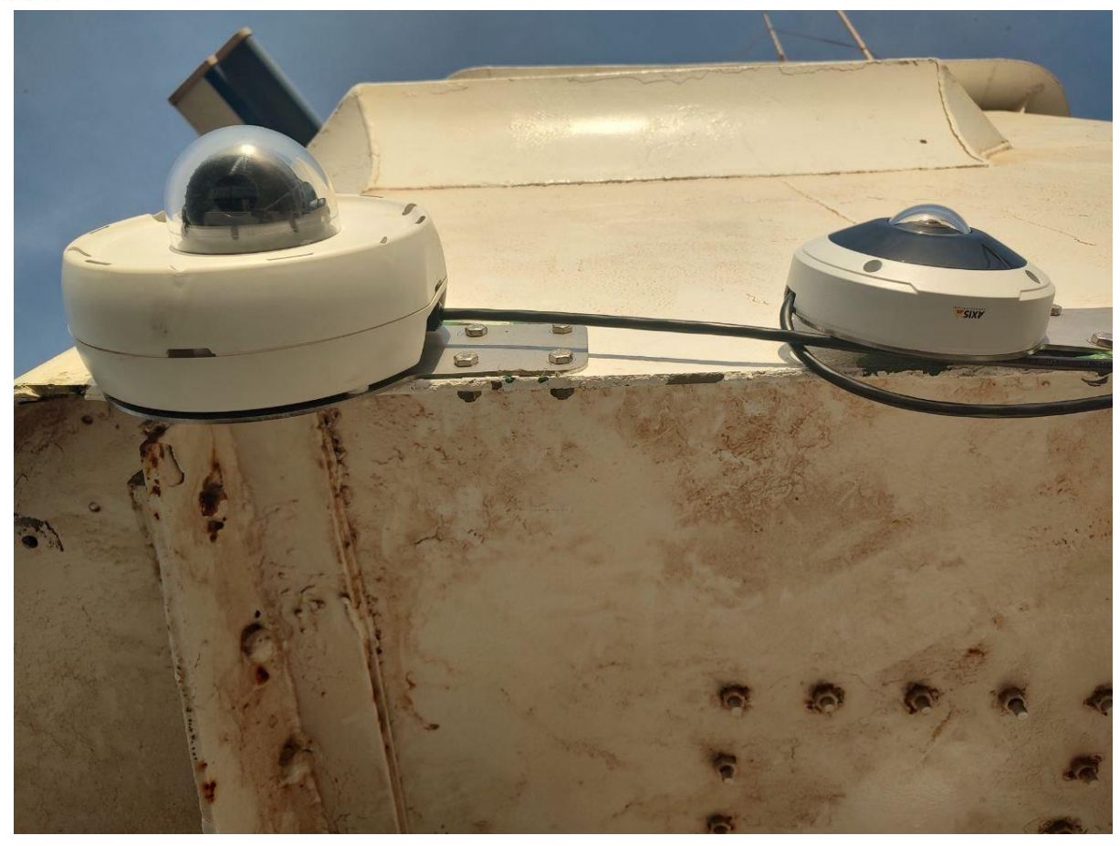
Figure 2: Two types of camera installed on the vessels within the Capsen and Grand Bleu FIP fleet