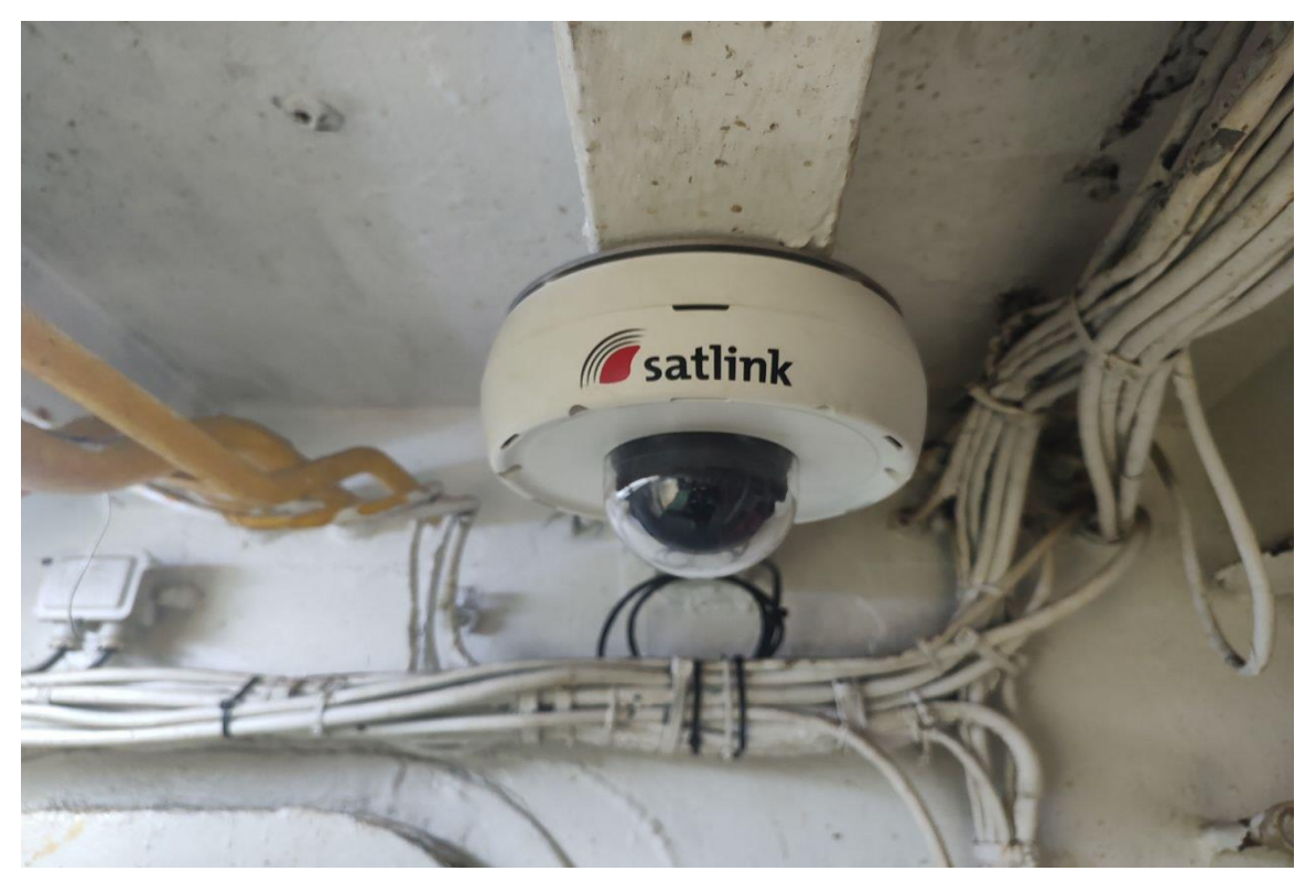
Figure 3: Photo of the camera installed onboard the vessels within the FIP fleet