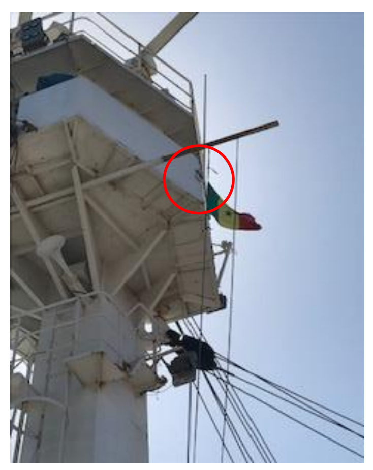
Figure 8: Photo of the camera positioned on the vessel above the \mbox{\tt deck}