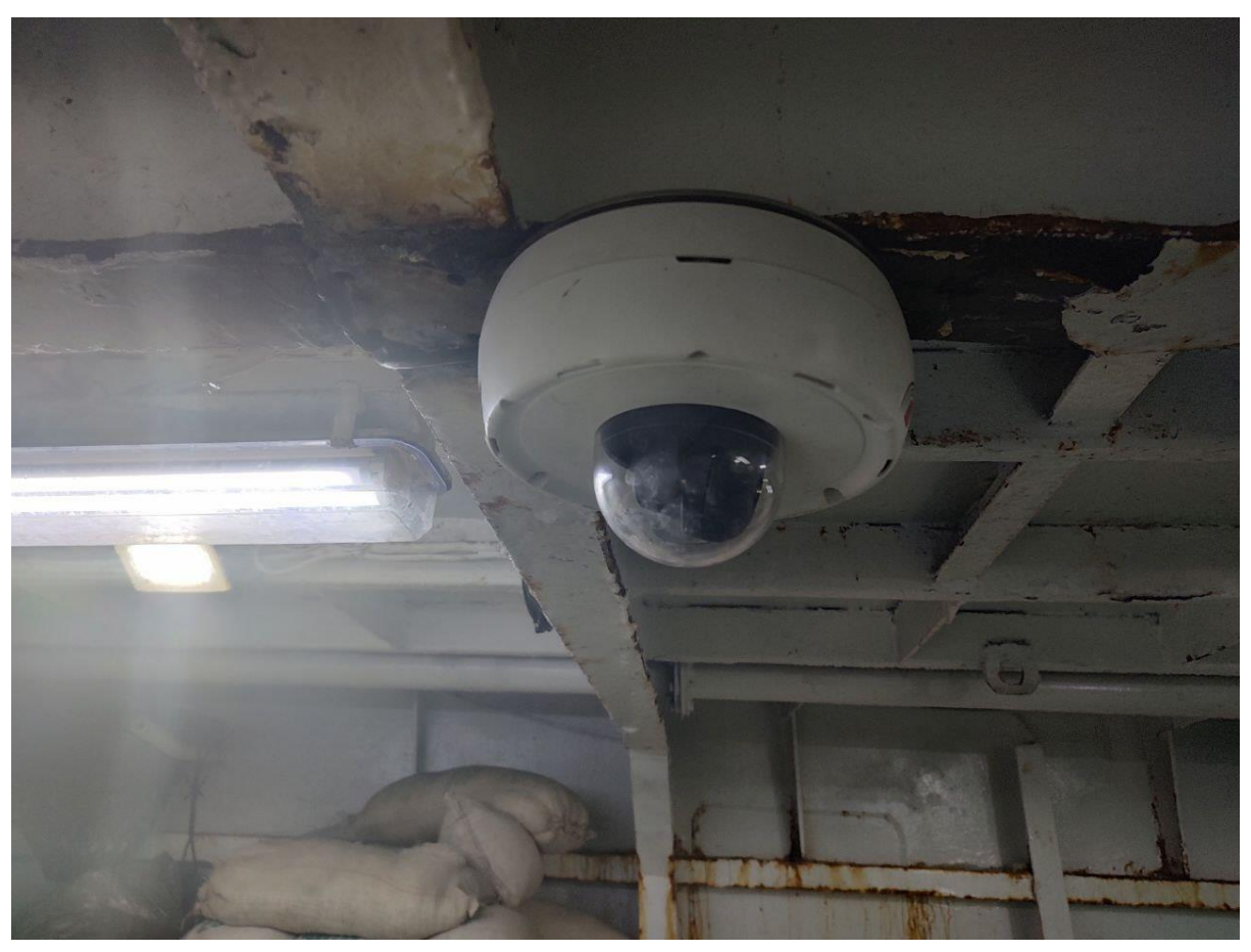
Figure 1: Photo of one Satlink camera onboard a vessel within the fleet