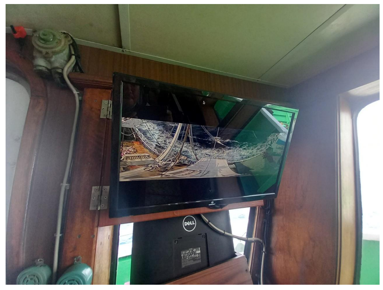
Figure 7: Photo of a still image taken from the cameras, displayed on the monitor in the bridge