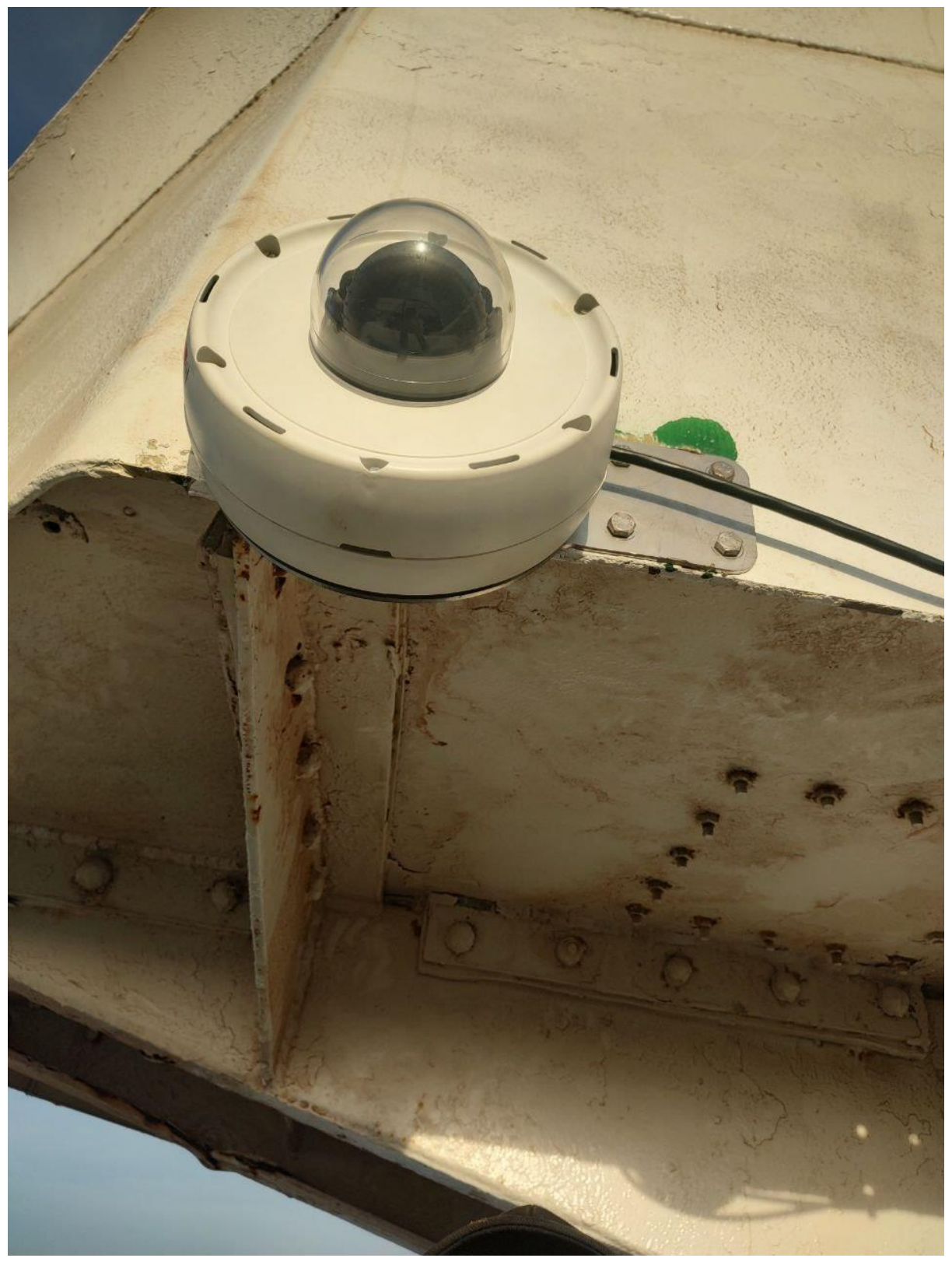
Figure 4: Photo of a camera installed on one of the vessels in the Capsen and Grand Bleu FIP fleet