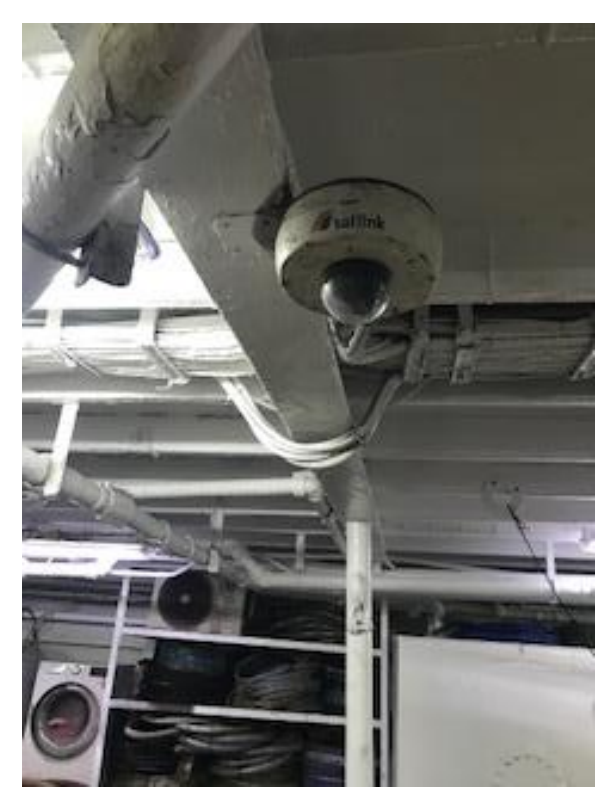
Figure 9: Photo of the camera installed on board the vessel in the brailer room to monitor the individuals that are brought on board the vessel