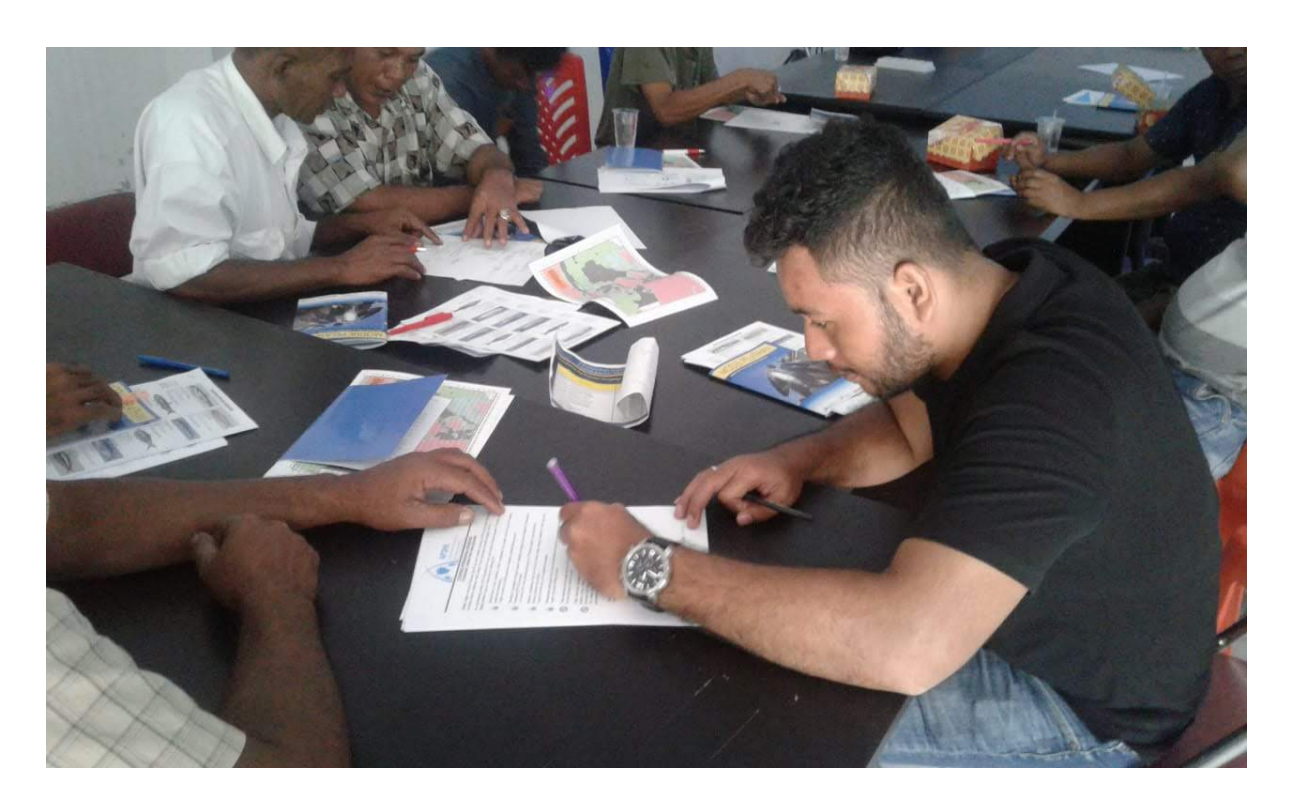
Figure 2Fishermen sign the code of conduct