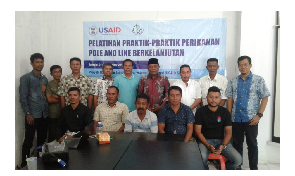
Pic. 1 Participant Training