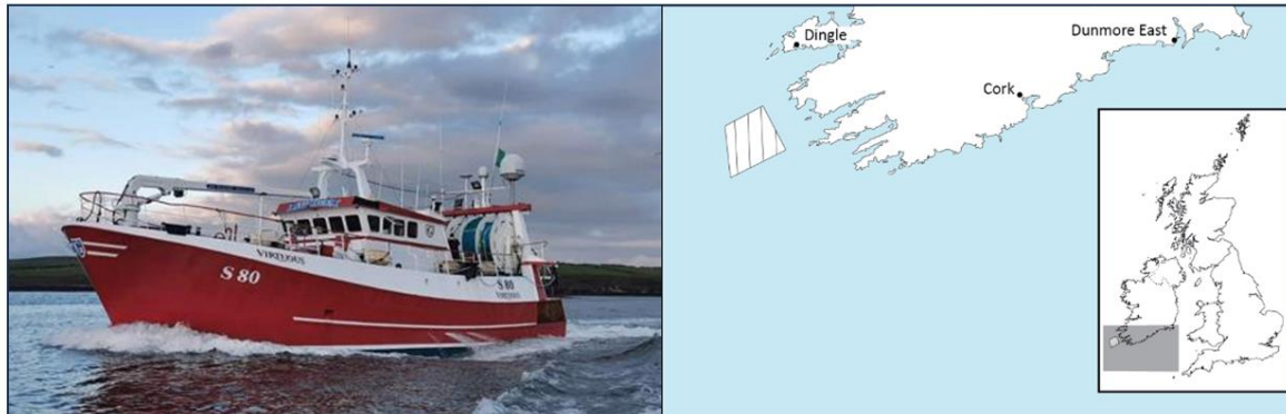
Figure 1. MFV Virtuous S80 (trial vessel) and trial location (hatched area)

lights on the headline (control). Hauls were evenly divided between day and night to account for diurnal variability which has been shown to occur in species such as haddock, in previous research (Krag et al., 2010).