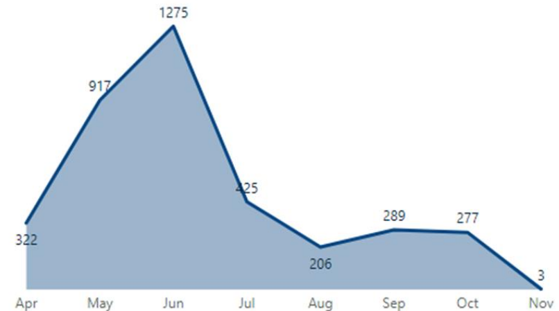
Hours by Month