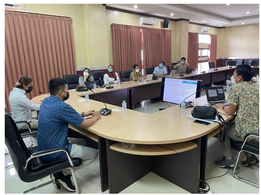
Meeting with lecturers and staffs of Marine and Fishery Faculty of University of Brawijaya