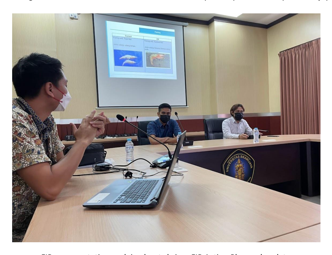
FIP representative explain about shrimp FIP Action Plan and updates