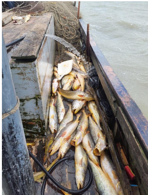
Some pictures taken by the captains using the tablet