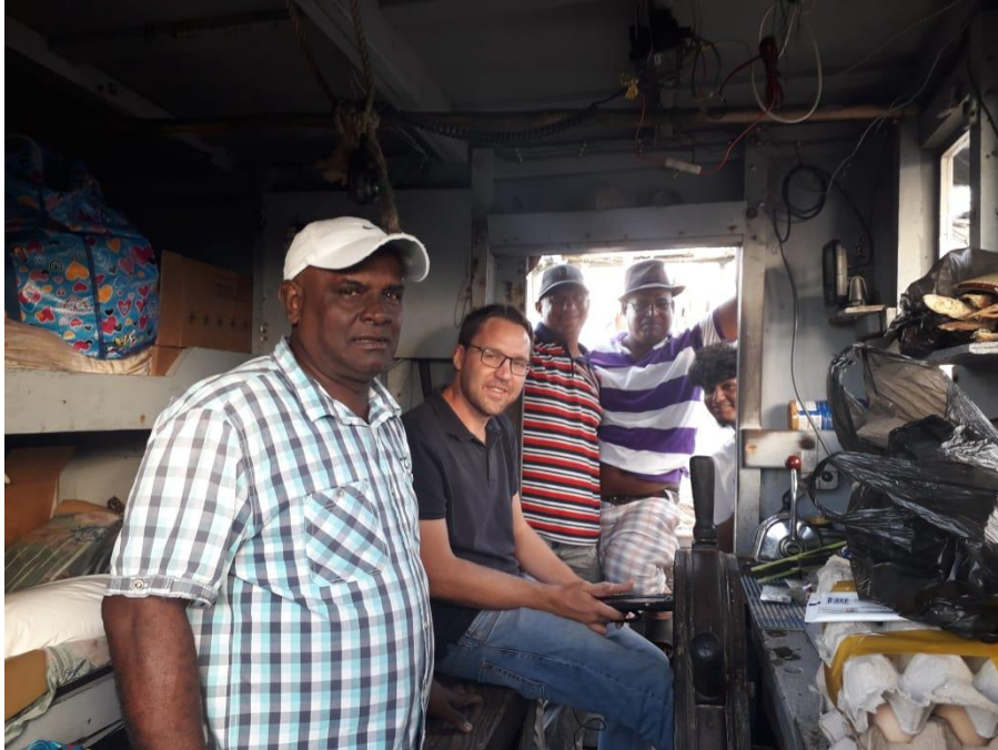
Onboard training of captains for the fisher-as-observer program

Centro Desarrollo y Pesca Sustentable Centre for Development and Sustainable Fisheries