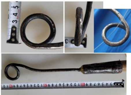
Ring shaped hook removal tool

You can easily and affordably have these tools made in your local town by the same shop that makes knives and farm tools