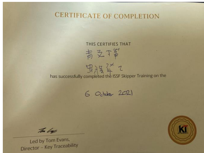
Figure 2 - Certificate of Skipper Training Completion

Topics of the training included introduction the FIP process, species ID, best practices, ETP management and waste management. All skippers were vocal and voiced which species they saw frequently and had strong species ID of sharks; however, seabirds were poor.