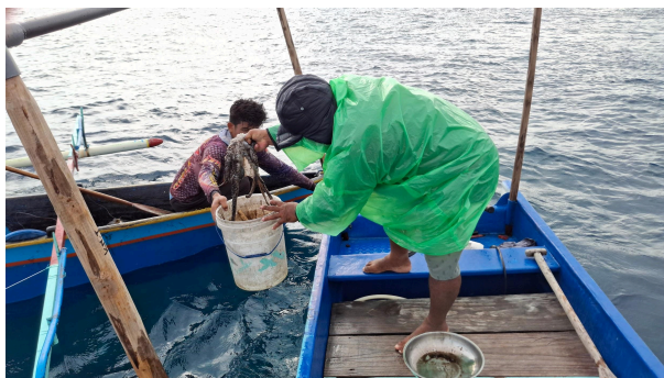
Appendix 3 Octopus buyer in Bulutui, Minahasa Utara record fisher catch during opening day