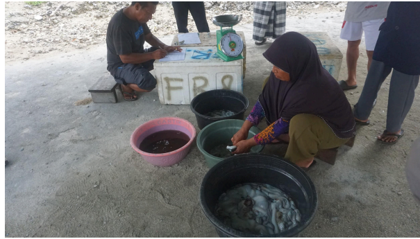
Appendix 4 Community-level octopus buyers in Lagongga, Wakatobi bought octopus fishers catch