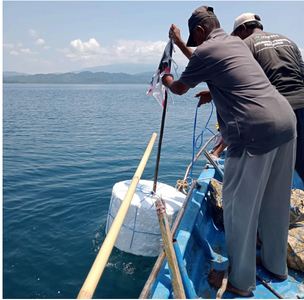
Appendix 1 Community member in Uwedikan, Banggai, was placing the octopus closure area marker