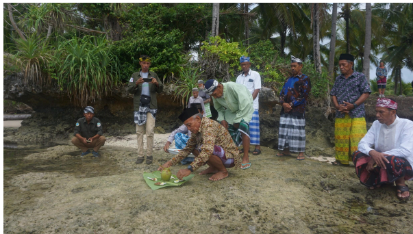
Appendix 2 Customary leaders in Kampo-Kampo, Wakatobi led the octopus closure ceremony