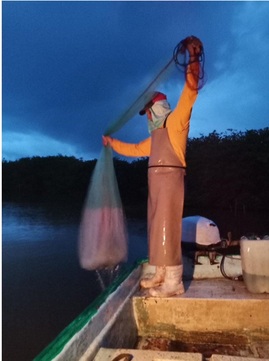
Figure 2. Cast net fishing gear used in the white shrimp fishery in Marismas Nacionales, Nayarit.

legally authorized fishing gear for shrimp in lagoon systems and, according to Mexican Official Standard NOM-002-PESC-93, must have a mesh opening of 1.5 inches (38.1 mm). Another fishing gear used in Marismas Nacionales is the so-called "tapos," a fixed fishing gear constructed from natural materials found in the region, which does not require a boat.