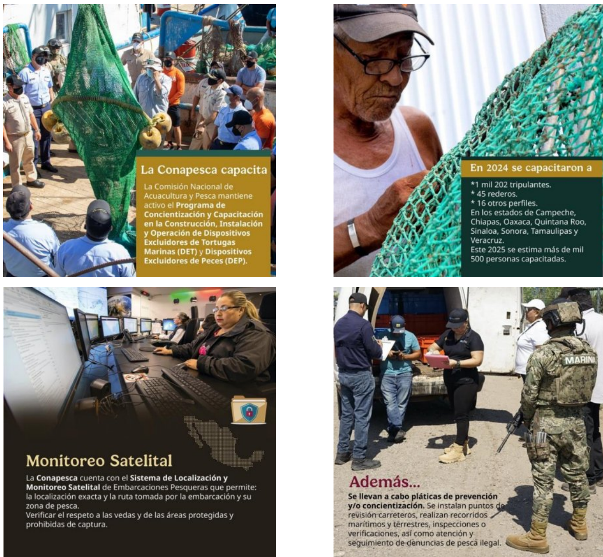
Figure 2. Fisheries authority infographic on inspection and surveillance of shrimp fleet gear use.

The fisheries authority in charge of inspection and surveillance not only carried out operations to reinforce the use of fishing gear and ensure proper harvesting during the fishing season but also provided training to the fishing sector on the correct use of the gear, particularly regarding the use of turtle excluder devices (TEDs). As a result, positive outcomes were achieved, with U.S. authorities maintaining the certification that allows shrimp exports to that country.