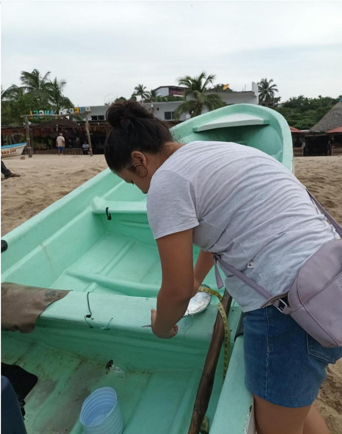
Photograph 6. Evidence of weight and size capture in black skipjacks during beach monitoring for the day of August 16, 2025.