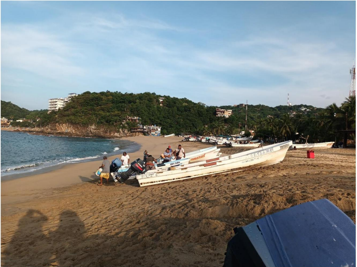
Photograph 7. Return of the vessels that went out to fish for black skipjack on August 22, 2025.