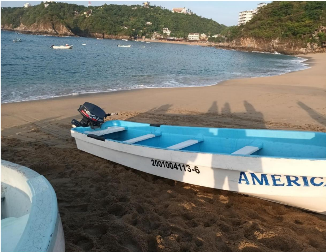
Photograph 8. Return of the vessel America that went out to fish for black skipjack on August 22, 2025.