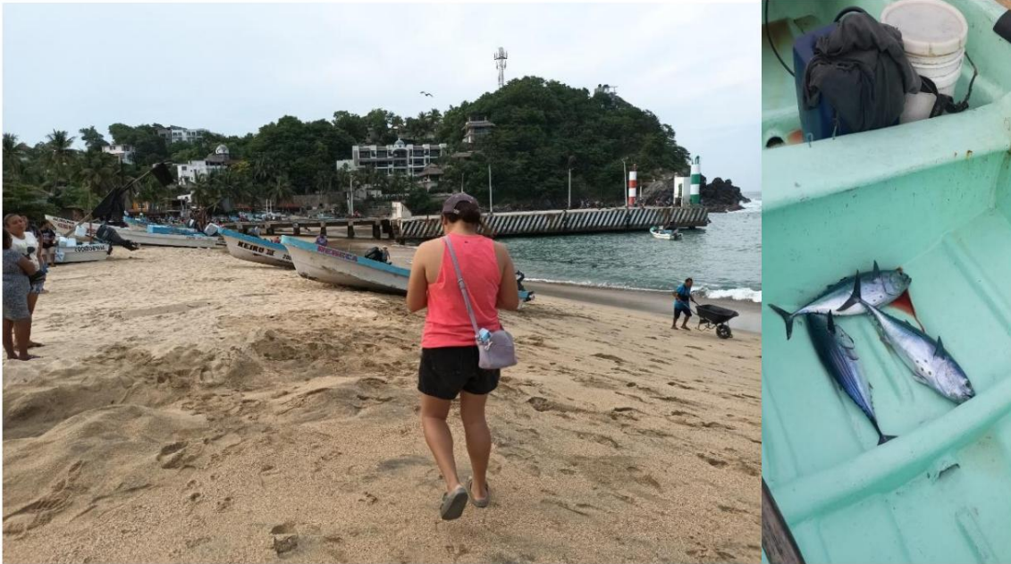
Photograph 4. Evidence of black skipjack monitoring on the vessels REBECA and KEIKO III.