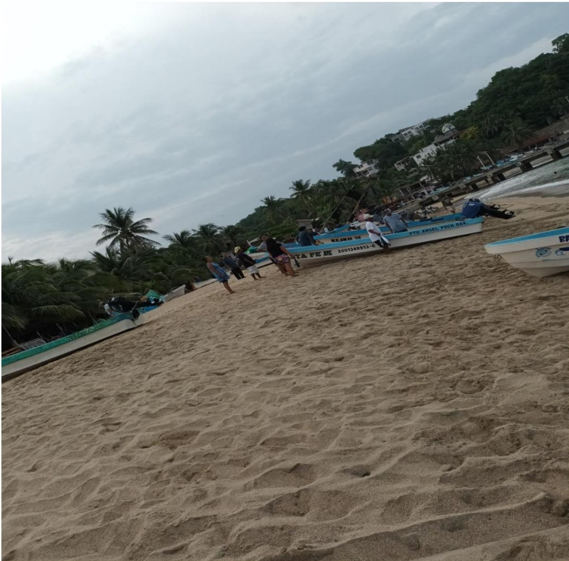
Photograph 5. Return of the Santa Fe III vessel from artisanal black skipjack fishing on August 16, 2025.