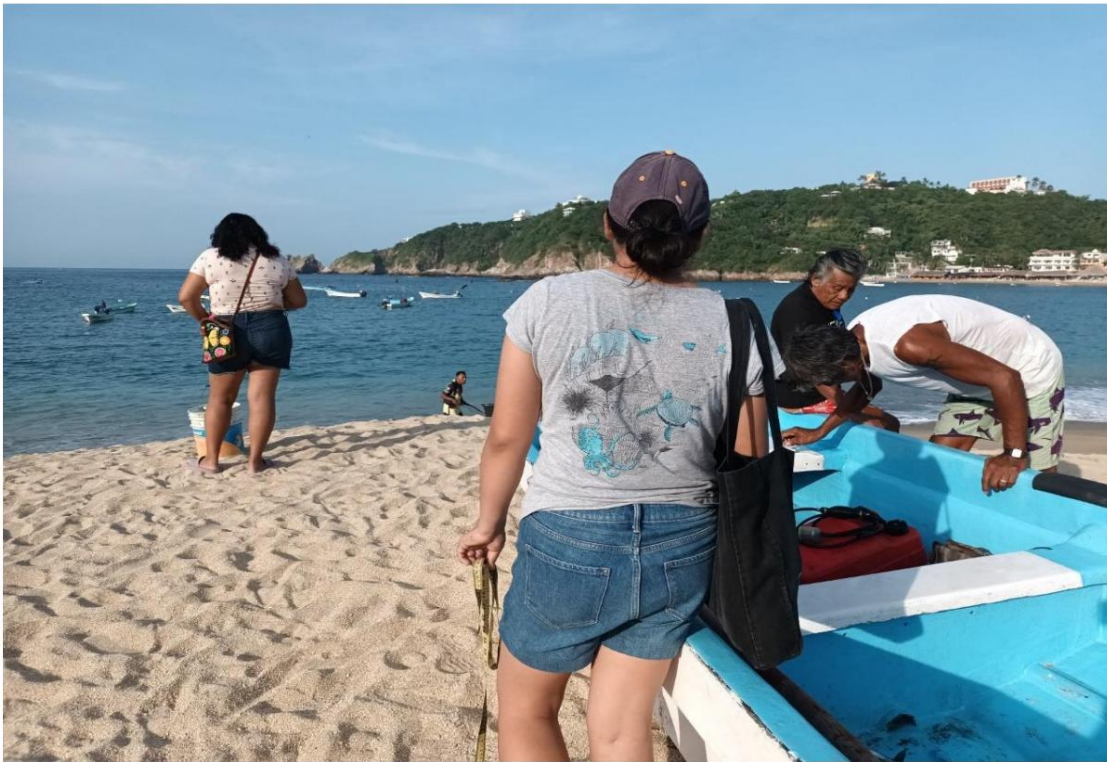
Photograph 2. Evidence of black skipjack monitoring on the vessel AMERICA.