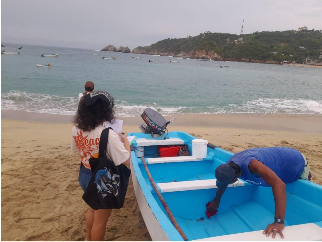
Photograph 12. Evidence of the sale and purchase of black skipjack on the vessel AMERICA.