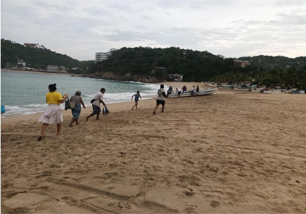
Photograph 10. Evidence of the high demand and rapid sale of skipjacks caught on August 29, 2025.