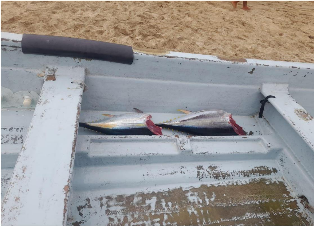
Photograph 13. Evidence of the capture of yellowfin tuna in the artisanal black skipjack fishery on August 29, 2025.