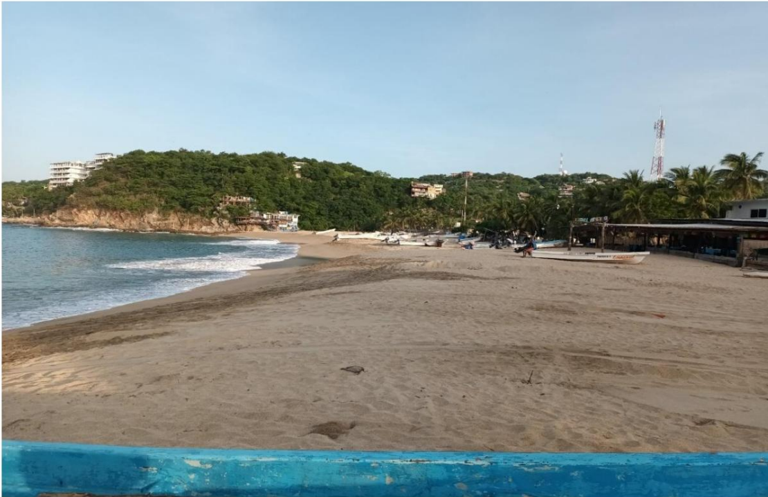
Photograph 1. Evidence of black skipjack monitoring