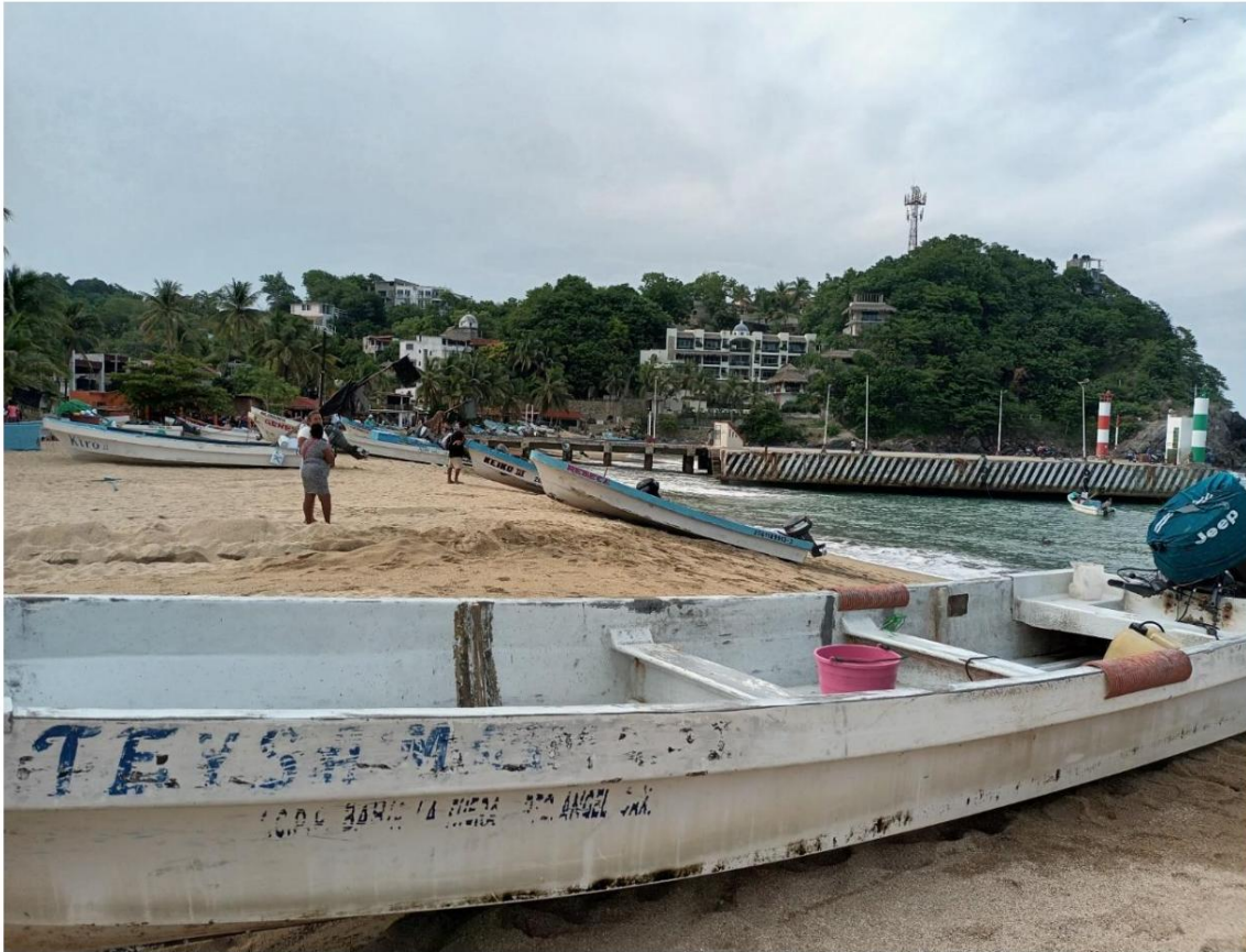
Photograph 3. Evidence of the vessels that went out to fish for black skipjack, August 9, 2025.