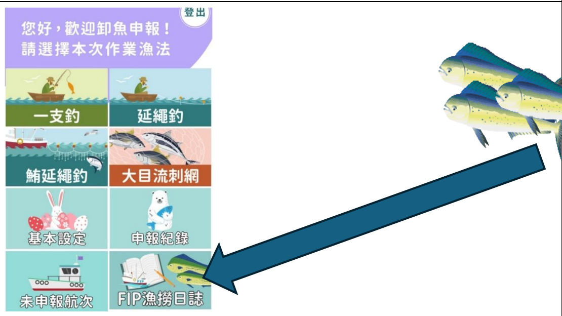
Screenshot of the FIP logbook in the APP: when Bycatch Record(混獲紀錄) button is selected, vessel operators will have record the bycatch species.