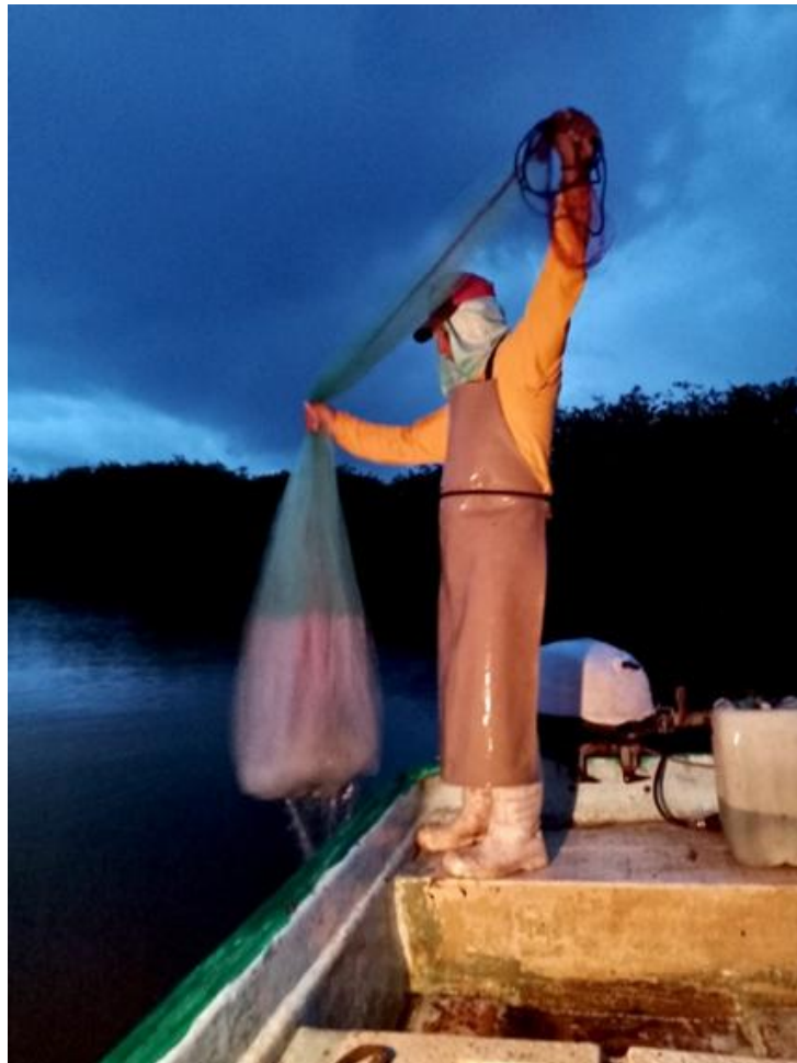
Figure 2. Cast net fishing gear used in the shrimp fishery in Marismas Nacionales, Nayarit.

The artisanal shrimp fishery in Nayarit is carried out in the lagoon and estuary systems of Marismas Nacionales using small boats (<12 m in length). This fishery comprises 636 vessels belonging to 25 fishing cooperatives. The cast net is the traditional fishing gear and is constructed with monofilament nylon line of 0.20 to 0.25 mm in diameter and a maximum height of up to 6 meters (Fig. 2). Mexican Official Standard NOM-002-PESC-93 establishes that the cast net used for shrimp fishing within lagoon systems must have a mesh opening of 1.5 inches (38.1 mm).